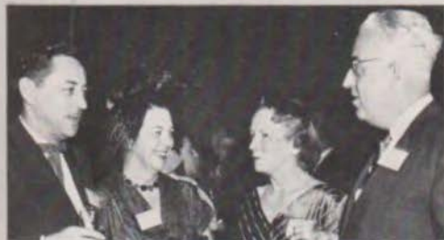
Spending night party time