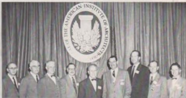
The new TSA Officers