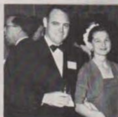
Producers' Dinner Party