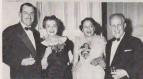
The Authors and the Hostess