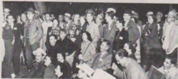
They're working hard here