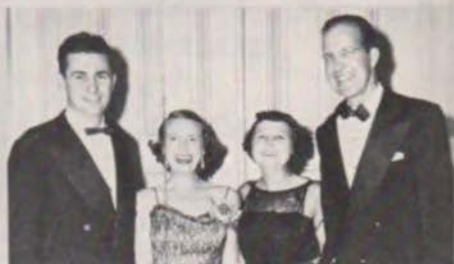
Just Before the President's Dinner