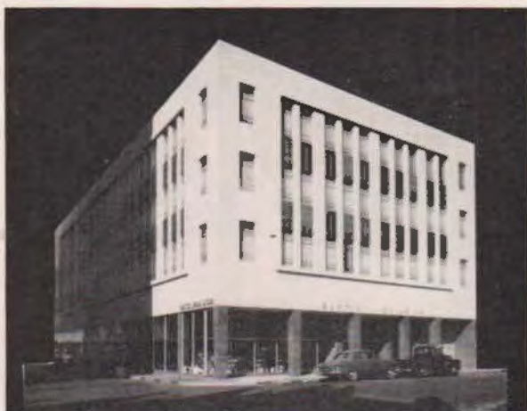
The New Baptist Building in Dallas