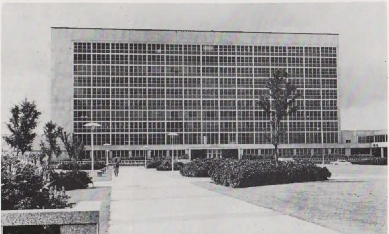
A startling contrast with New Orleans' historic, ever-popular French Quarter is provided by its new City Hall, shown above, one of four government buildings surrounding beautifully-landscaped Duncan Plaza and covering an area of 14 acres in the central business district.

So, take all of these ingredients, put them together and you will see some very good reasons why the New Orleans convention has much to offer — in entertainment, refreshment, stimulating conversation and a galaxy of new ideas for you and your work for years to come.