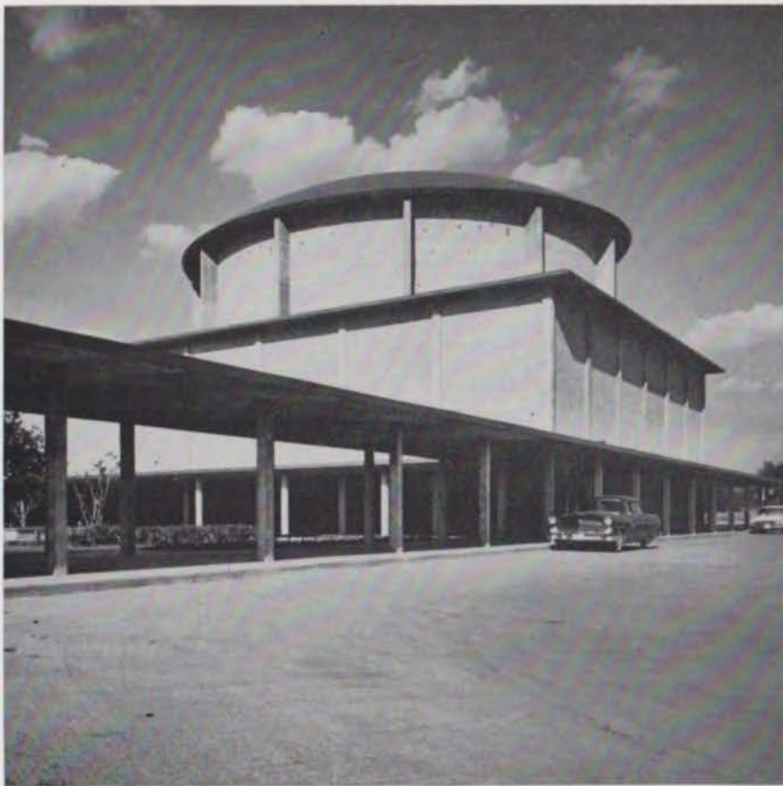
A religious symbol of great utility is Temple Emanu-el in Dallas, with its high-domed center and many other unusual features.

Perhaps the greatest achievement of the Temple Emanu-El in Dallas is the acceptance of the sanctuary by people of all religious faiths as a place of worship and a source of great religious inspiration. The site is an eighteen-acre tract at Hillcrest Avenue and Northwest Highway