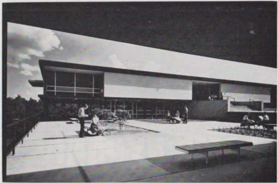
Pleasant courtyards between classroom buildings are one of the distinctive features of San Angelo's award-winning, campus-type high school.

Responsibility for the art work on the project was given to Profes-