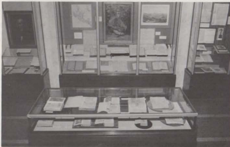
The well-displayed relics of Texas history are in sharp contrast to their precarious condition of only two years ago.