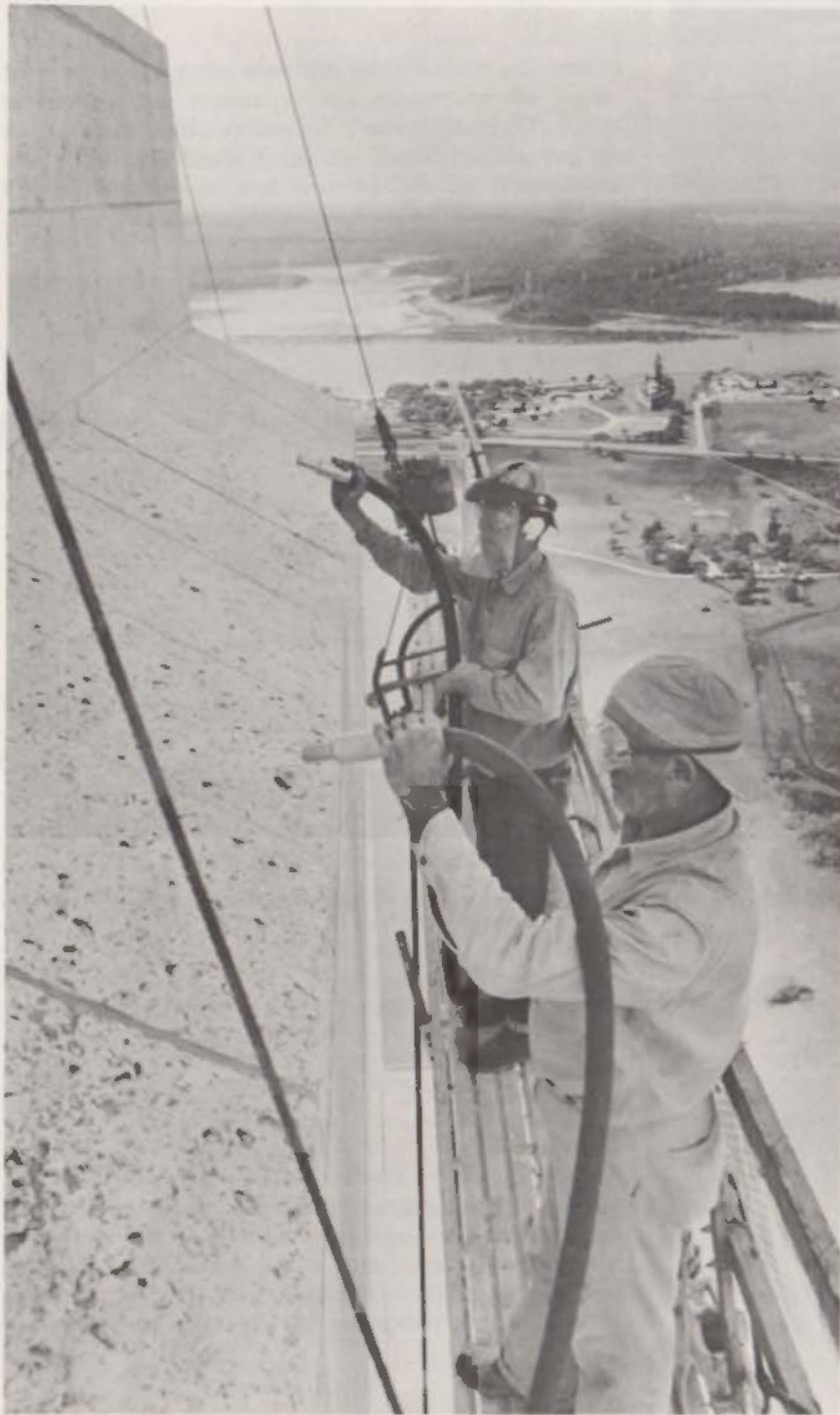
Workman high atop the shaft clean and waterproof the long neglected monument. Note the battleship "Texas" moored in the background.