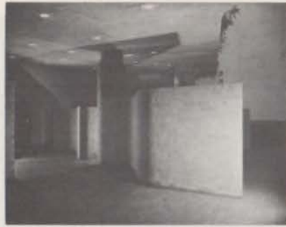
PRATT, BOX & HENDERSON