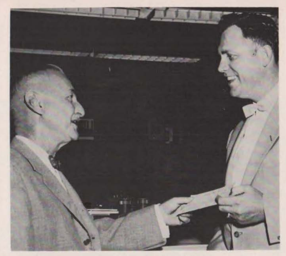
Presents Scholarship Check

The Federal commission was given virtually a free hand in determining the location and characteristics of the new center, and one of its first acts was to solicit outstanding talent from over the nation, on a voluntary basis, to provide professional advice in the fields of architecture, engineering and planning.