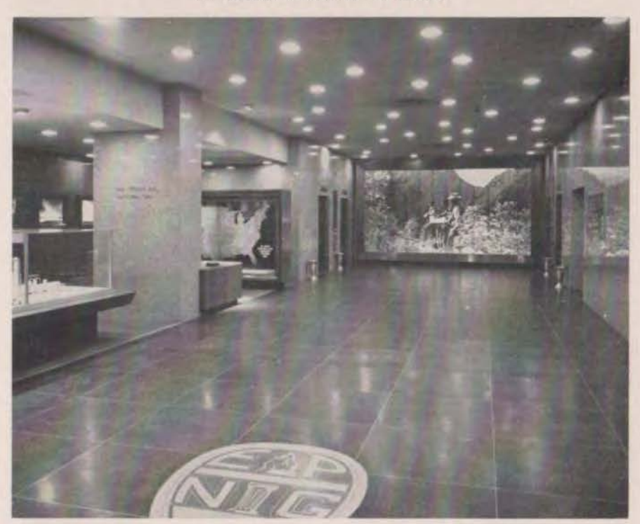
An interior view of the Home Office Building of the El Paso Natural Gas Company in El Paso, showing entrance lobby exhibition area. This structure, designed by Carroll & Daeuble, TSA-AIA, was selected by members of the El Paso Chapter, AIA, as representative of recent work in the Chapter area.

in the use of space. Typical floors have rubber tile. Lobbies have terrozzo floors. All windows in the building have light-diffusing and heat-absorbing colored plate glass. The sash are kept locked except for cleaning, which is done from inside the building by a vertical flue-type operation of the sash.