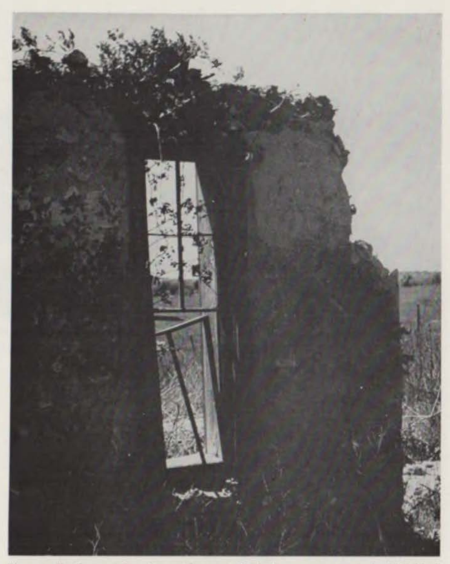
These walls, the remains of a residence at Kimball, were constructed of "Tabby" — a type of concrete used extensively during the Nineteenth Century.

Itw as not too long after Sam Bass' appearance in the neighborhood that other activity began. Irish section hands were laying the rails for