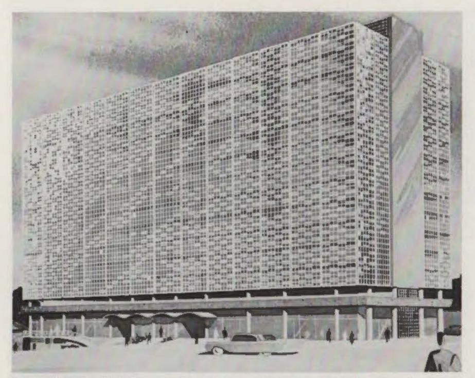
This architect's sketch shows the exterior, featuring walls of pre-cast concrete of the new motor hotel in which guests go up to their rooms in their own automobiles.

the guest while the car is being hoisted to his suite. And the minute the patron's car is delivered to his private car port next to his room, the door to the elevator shaft is electronically locked for complete safety.